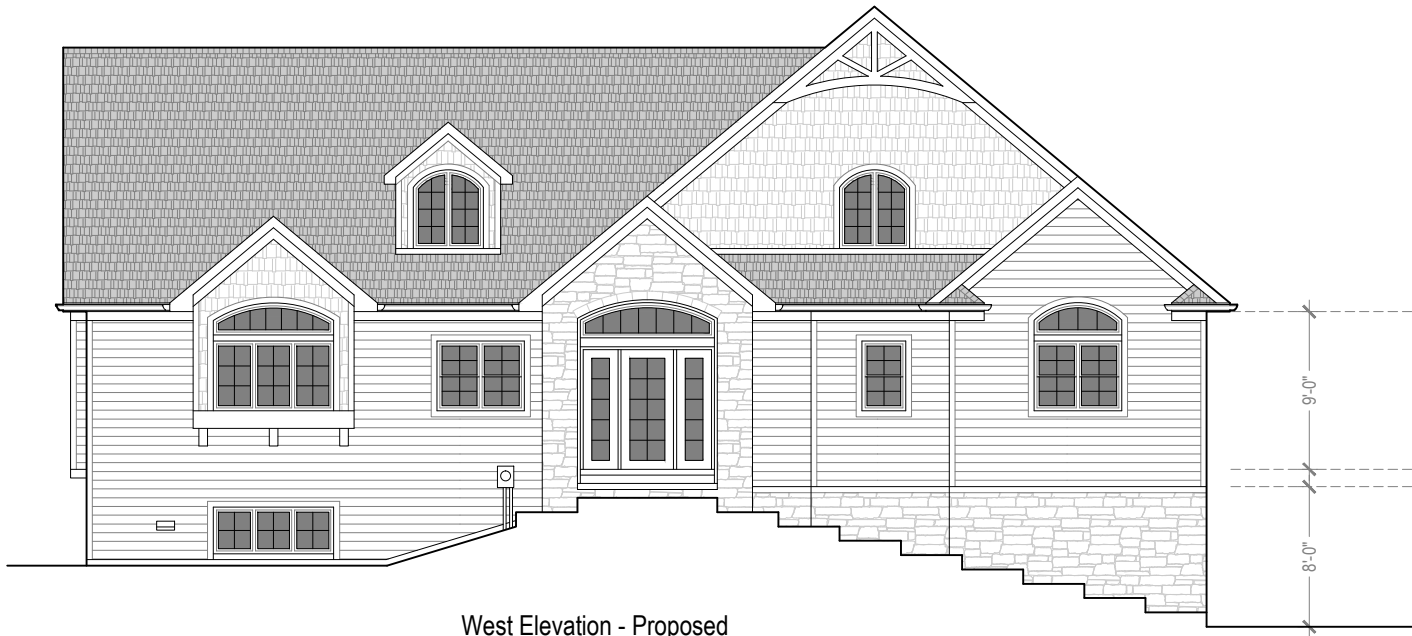
West Elevation - Proposed