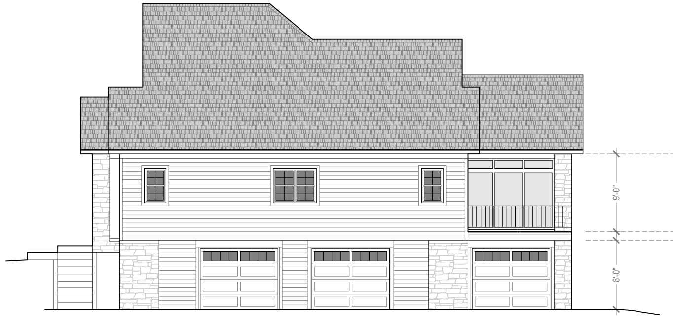
South Elevation - Proposed