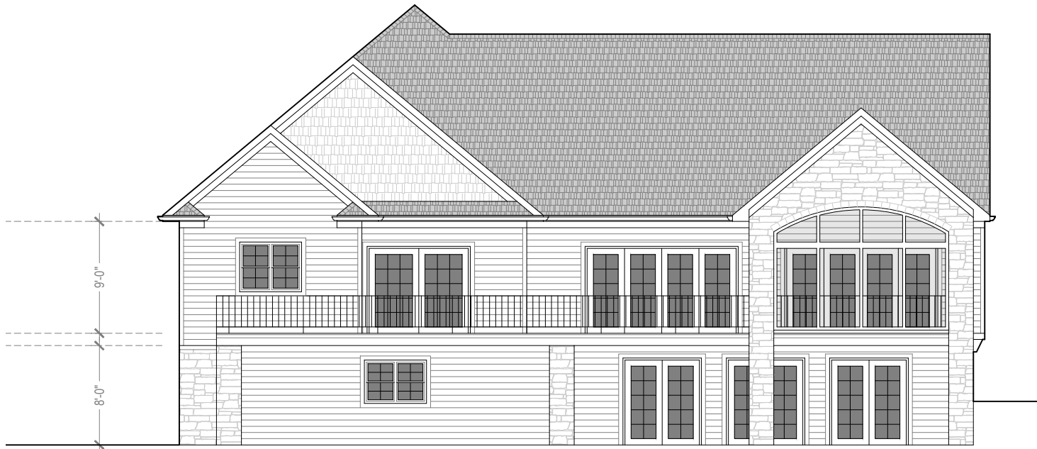
East Elevation - Proposed