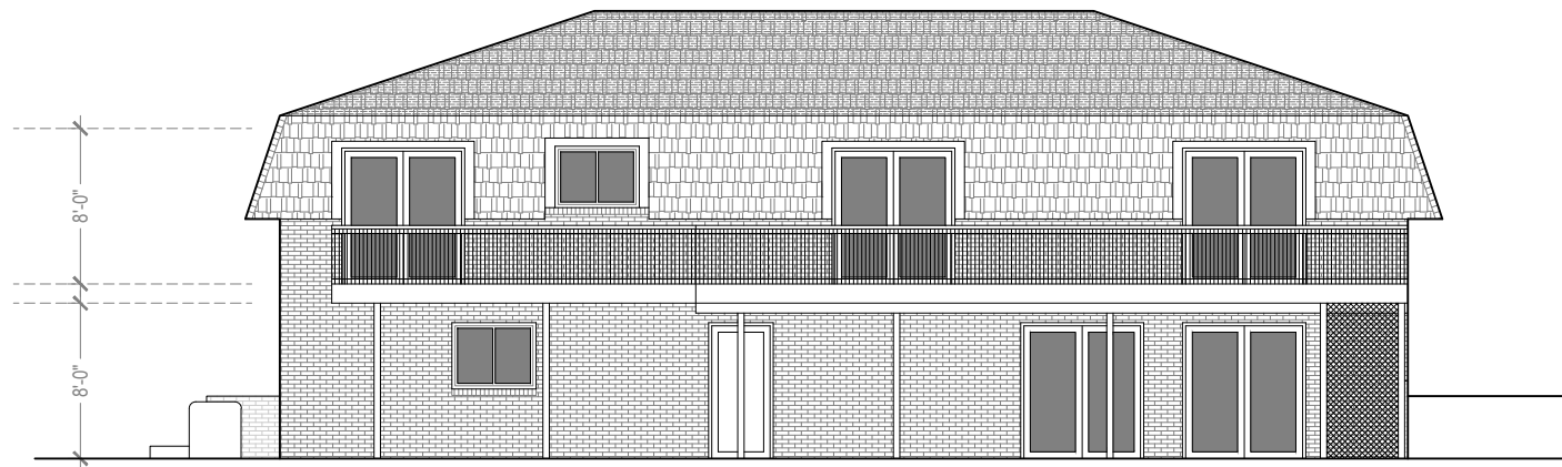
East Elevation - Existing