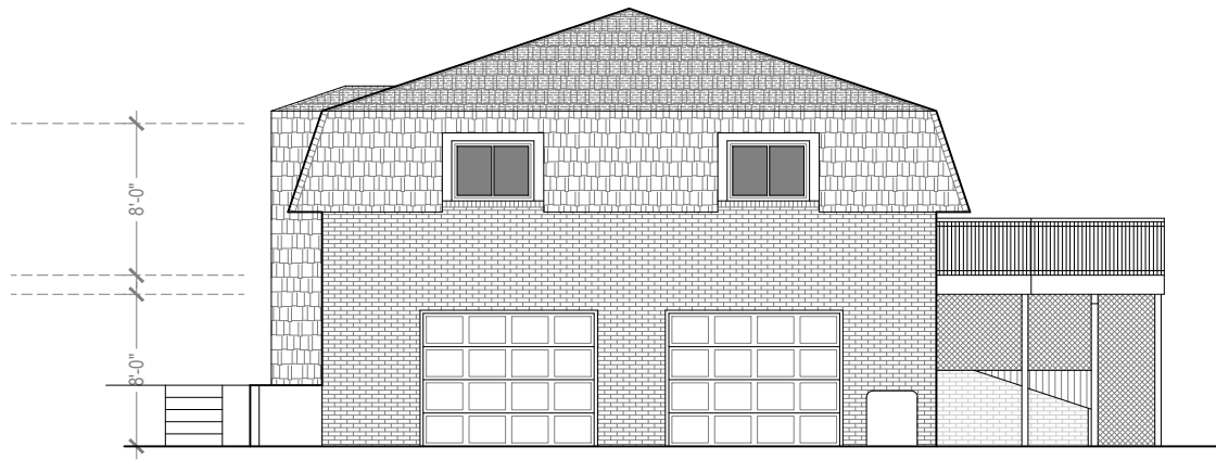
South Elevation - Existing